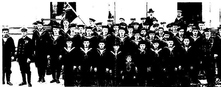
The Winnipeg Boys' Naval Brigade — October 1920

Every assistance in establishing the brigade was promised by the Navy