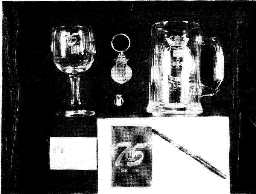
Your registration fee includes a complete souvenir package

S ouvenirs are a great way to help you remember the good time you had at any event — the 75th Anniversary Reunion is no exception. An excellent souvenir package has been put together for this event.